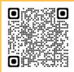
Influenza (Flu) Vaccine Fact Sheet