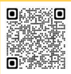
COVID Vaccine Fact Sheet