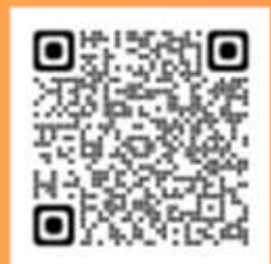
Pneumo-20 Fact Sheet