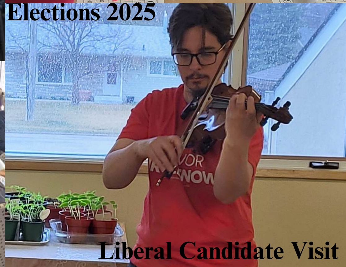
Liberal Candidate Visit