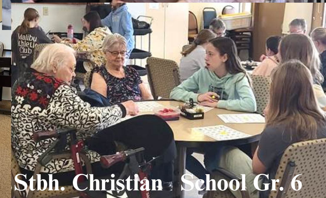
Stbh. Christian School Gr. 6