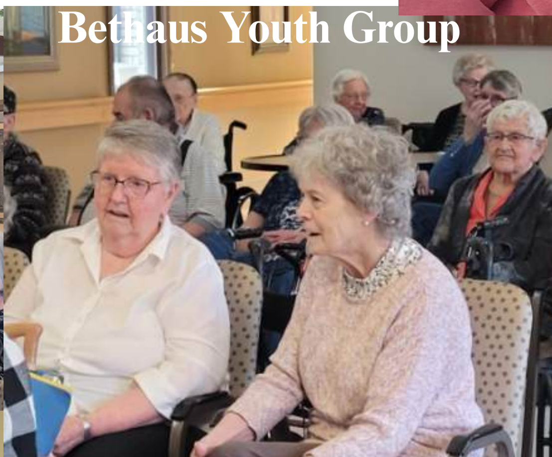
Bethaus Youth Group