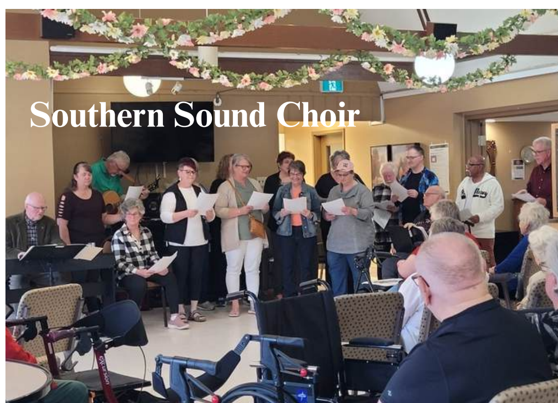
Southern Sound Choir