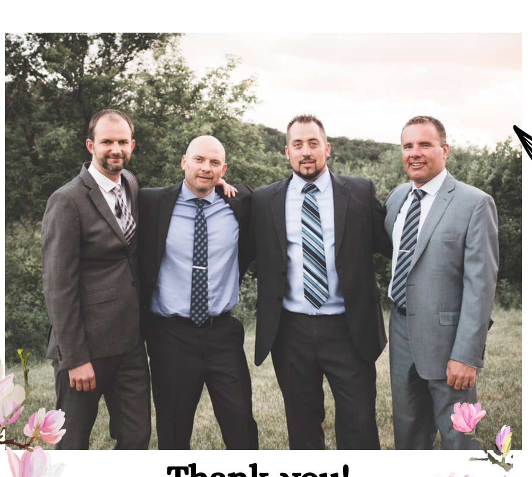
Thank-you! Glorybound Quartet