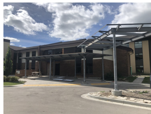
New Canopy, Rest Haven

HavenGroup continues to celebrate its milestone May 2022 opening of the new Rest Haven Care Home, a 143 bed facility made up of twelve households over an expanse of 96,000 square feet. The final phase of the Project, the upgrades and retrofit of 30,000 square feet of the former facilities, is progressing well and should be complete by the end of 2022.