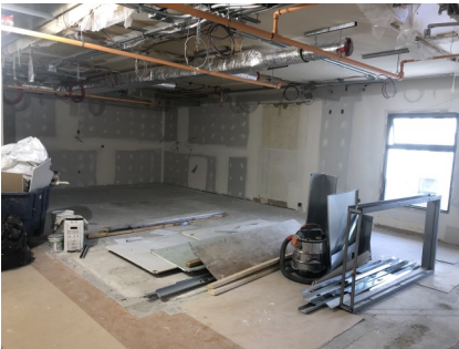
2 nd Floor Retrofit, Construction

We are pleased that HavenGroup was able to hire 75 personnel over the last year, allowing us to provide excellence in care to our growing resident population. We expect that up to an additional 75 staff will need to join HavenGroup's current staff of 200 heading into 2023.