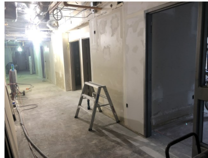
2 nd Floor Retrofit, Construction