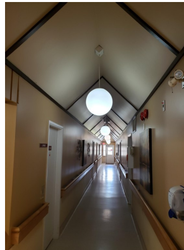
Old Lighting, Cedarwood

Cedarwood Supportive Housing is extremely grateful for the $200,000 contribution by the HavenGroup Foundation for the nearly $500,000 cost of the Project. Stated succinctly, Cedarwood would not have been able to move forward on this long awaited Project without the support given by the HavenGroup Foundation.