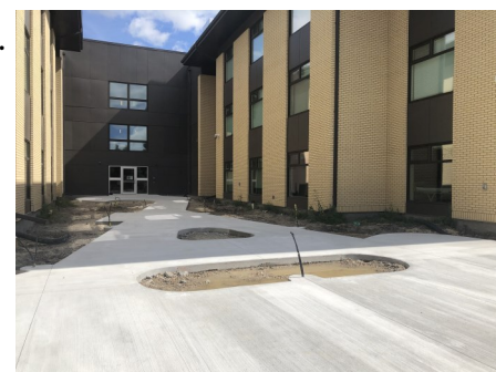
Landscaping, Rest Haven

Rest Haven is currently licensed for 96 residents located on the 2nd and 3rd floors of the new build. The first floor is used for other support services in the interim. We have admitted more than 25 new residents over the last few months. Rest Haven's total resident population is encroaching 70. It is expected that Rest Haven will be home to 96 residents by calendar year end, significantly minimizing the overall Personal Care Home (PCH) wait list in Steinbach and area. At Project end, the remaining part of the facilities will be turned over to HavenGroup. The admission of additional residents beyond the initial 96 persons, will proceed beginning in 2023, subject to license approval and staffing.