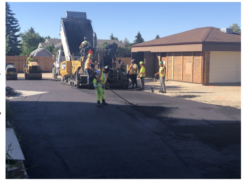
Paving, South Staff Parking Lot

With the significant funding contributions of the Foundation, residents of Rest Haven can now enjoy the new physical facilities. In addition, staff, as they have in the past, continue to serve residents in an environment of comfort, purpose, and hope; significantly enhanced by utilizing DementiAbility elements in daily life activities. Therefore, we say with confidence—A New Rest Haven Built on Former Foundations!