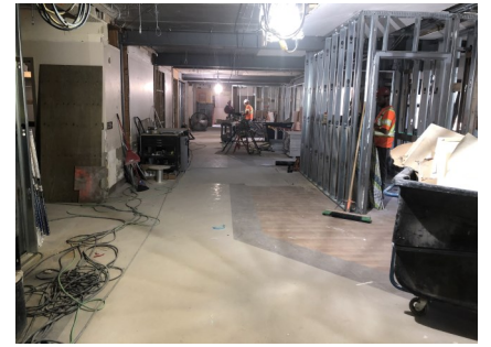
1 st Floor Retrofit, Construction