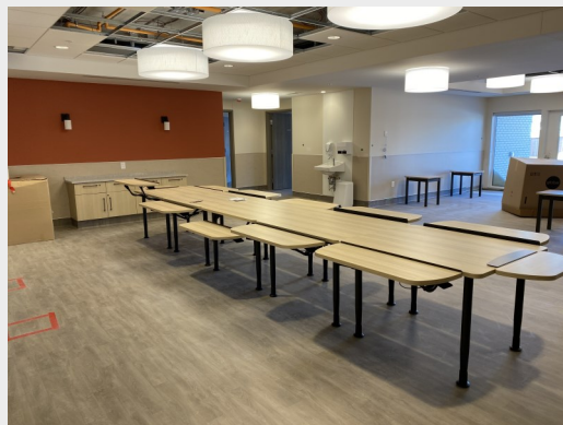
Bottom Row (left & center): Atrium