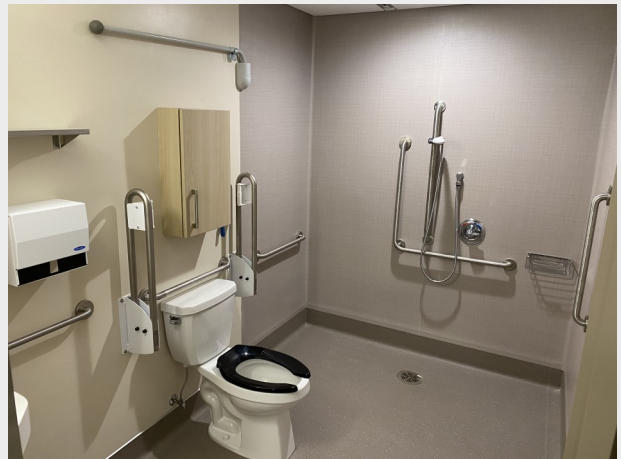
Resident private room & personal bathroom complete with shower